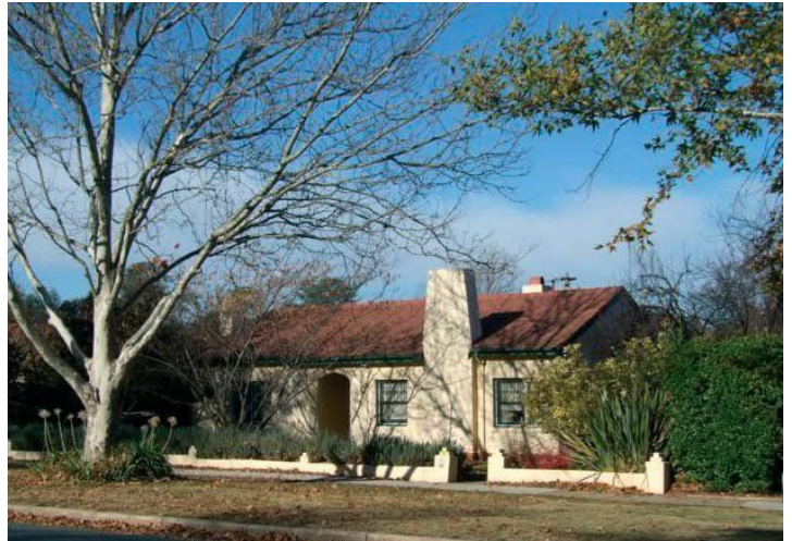
A 1920s Federal Capital Commission (FCC) Type 9 house circa 1926 (left) and a 'reversed plan' example today (right).

Once again, the National Trust (ACT) in collaboration with the Reid Residents' Association (RRA) and the property owners will open three privately-owned houses and gardens from the 1920s & 1930s in Reid's Heritage precinct. The houses and their gardens, which have not been previously opened, will be available for inspection. Meet the owners and view inside the houses and also their gardens. The properties comprise two late 1920s Federal Capital Commission (FCC) houses (both FCC Type 9, substantially extended), and a 1934 Dept. of Interior Type "L" (amended) house.